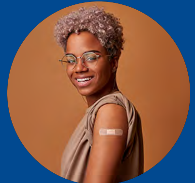
COVID-19 Vaccination and Testing Events