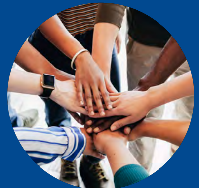
Resource Distribution Events